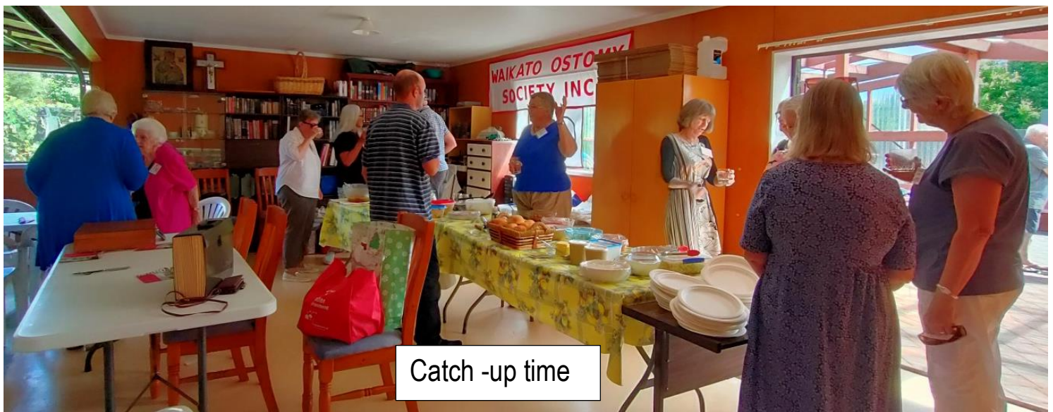
Catch -up time